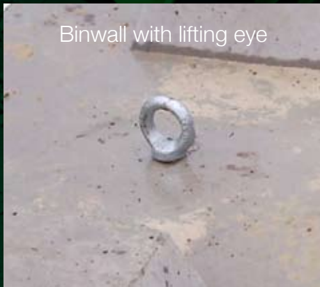
Binwall with lifting eye