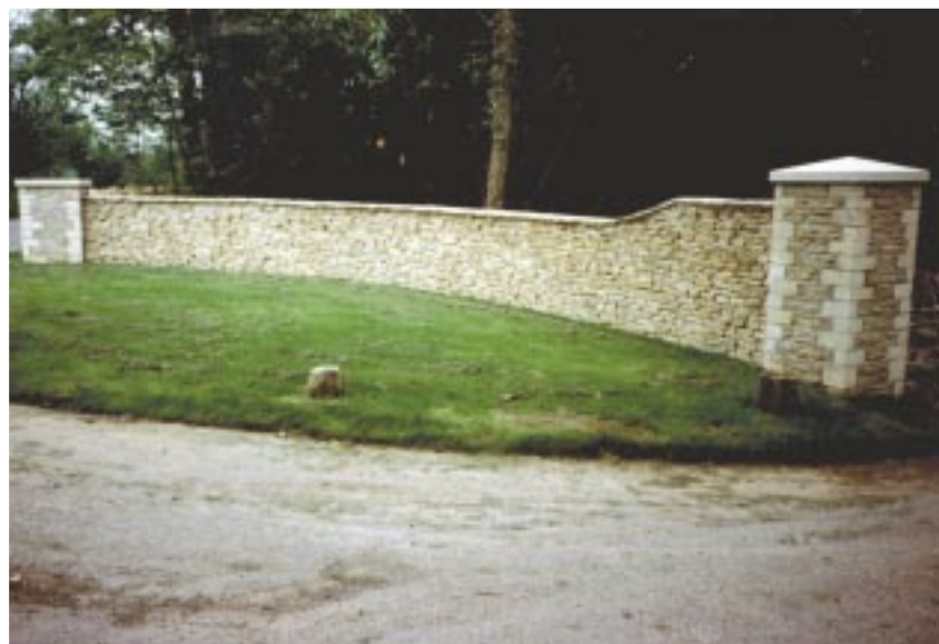
Walling at Salperton Park Estate

Huntsmans Quarries Ltd Naunton, Cheltenham, Gloucestershire