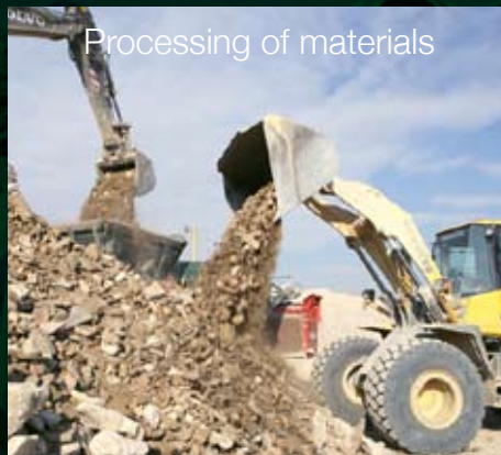
Processing of materials