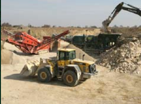
Reclaimed & recycling area